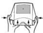
press to set up .....

© 2003 lumage, registered trade mark, patent pending, made in holland