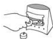
Place candle and light it. ...